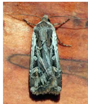
Three army cutworms (“miller moths”) showing range of patterning.