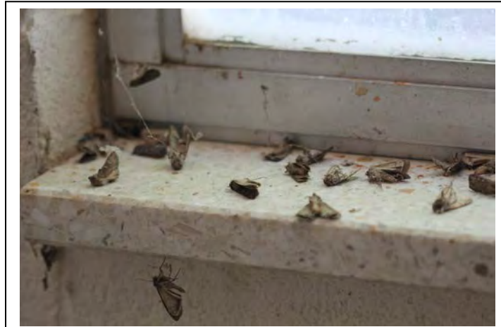
Aggregations of dead miller moths collect around windows and behind walls.

When large numbers die in a home there may be a small odor problem (due to the fat in their bodies turning rancid). Also, unless they are cleaned out, old moths may serve as food for carpet beetles and other household scavengers. These secondary insects may become problems in subsequent years.