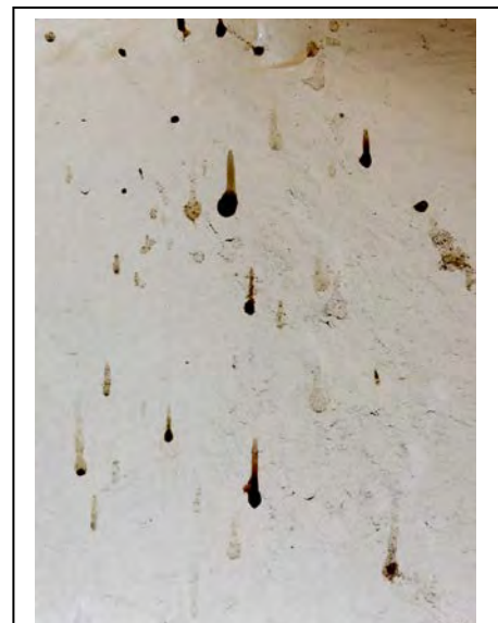
Spotting on walls produced by the meconium of army cutworm moths.

In addition, miller moths are able to produce and excrete fluid for most of their adult life (a process known as “rectal loading”). This product is slightly acidic and is sprayed by the moth. Presumably the purpose of this is defensive, although it is not particularly irritating to humans.