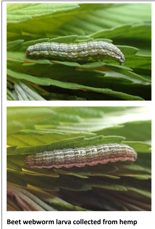
Beet webworm larva collected from hemp