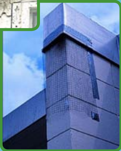
Right: Mesh bird netting secured at top but not bottom to allow bats to exit but not reenter (IFAS extension).