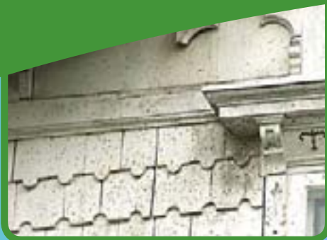
Left: Droppings and staining near bat entrances indicate a roost (batmanagement.com).