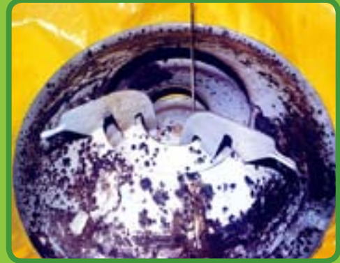
Above: Mold growth on air diffuser in ceiling.