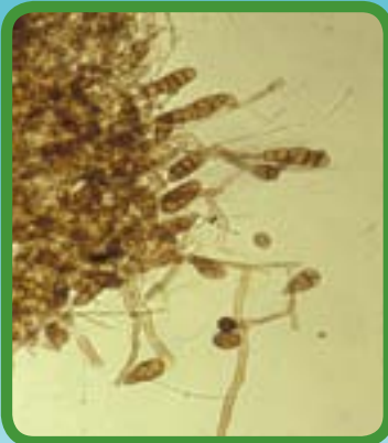
Above: Alternaria spores