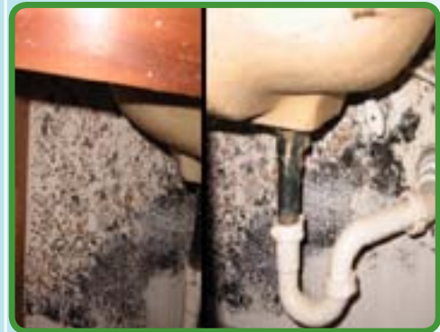
Above: Mold on drywall under leaky sink.

Once mold starts to grow in insulation or wallboard, the only way to deal with the problem is to remove and replace the contaminated building materials. If large areas are contaminated, use an experienced professional contractor. Contact the Colorado Department of Public Health and Environment at www.cdphe.state.co.us/ap/IAQhom.html