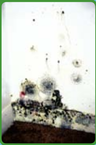
Above: Mold growing in closet as a result of condensation from room air.

All molds should be treated with respect to potential health risks. If mold contamination in a building is extensive, many spores can be released into the air. People exposed to these spores can become sensitized and develop allergies to the mold or other health problems. Individuals with immune suppression may be at increased risk. If you or your family members have these conditions, contact a qualified medical clinician for diagnosis and treatment.