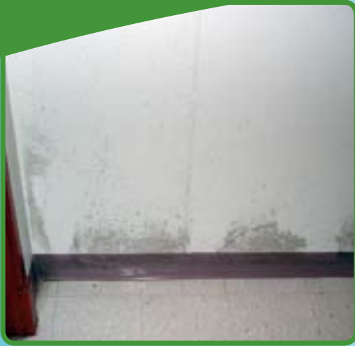
Left: Mold on painted concrete in a school building. Rainwater is wicking directly through the concrete walls, and there is also condensation on the earth-chilled concrete. The floor is about 3 feet below ground level.