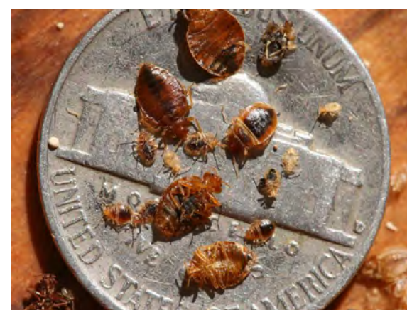
Various life stages of bed bugs.