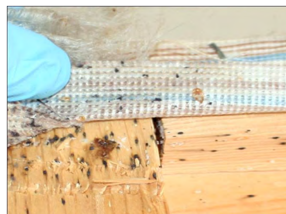
Bed bug adults, nymphs, cast skins and fecal spotting on the bottom of a box spring.