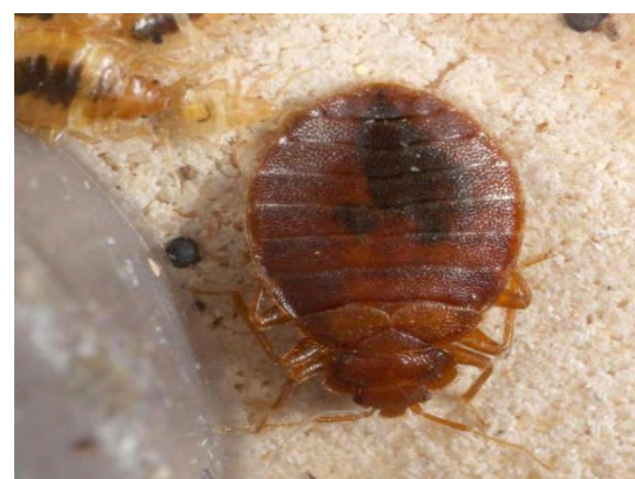
Bed bug nymphs.

Bed bugs tend to group in dark enclosed areas to rest between feeding events. These aggregation sites may be indicated by spotting produced by bed bug excrement, oval cream colored eggs, old skins from molted bed bugs as well as various active life stages.