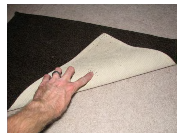
Bed bug fecal spotting on the bottom of a rug.