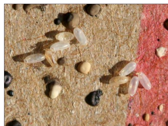
Bed bug eggs and fecal spotting.

Where would I find bed bugs? The great majority of bed bugs will be on or in the near vicinity of sleeping sites used by humans. Bed bugs feed at night, always avoiding light, and spend the rest of the time tucked in cracks and crevices such as mattress seams and box springs, corners of bed frames and side tables, or behind molding and pictures.