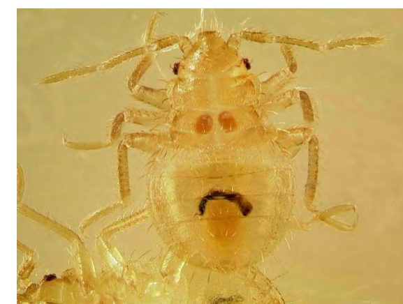
Newly hatched bed bug nymph.