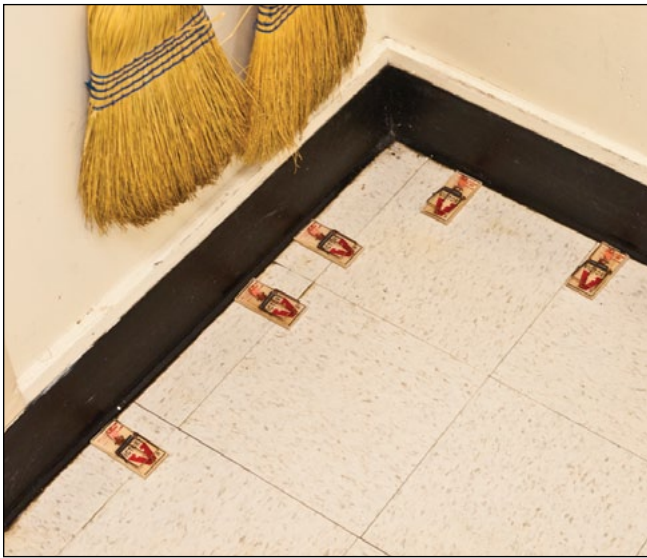
Figure 6. Set out several traps about 3 feet apart and sometimes closer, then remove them and set them up a week later in a new location.