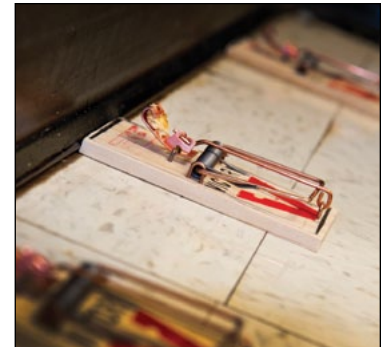
Figure 8. The proper way to position a snap trap against the wall.

Traps can be baited with small smudges of chocolate syrup or a few drops of vanilla, orange, or any other extract oils (Figure 7).