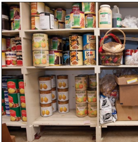
Figure 5. Once inside a school, mice will nest in such mouse-vulnerable areas as a food pantry or stuffed furniture in a staff lounge.