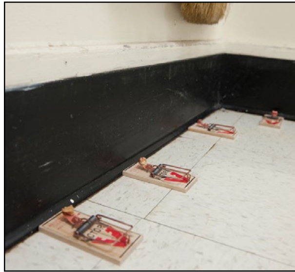
Figure 7. Traps can be baited with a variety of foods. There is no one favorite bait for mice.

Plastic snap traps (e.g., the Kness Snap-E, J.T. Eaton JAWZ, Bell Trapper Mini Rex, Woodstream Quick Kill, etc.) are more durable and can be cleaned with disinfectants more easily. The disposable