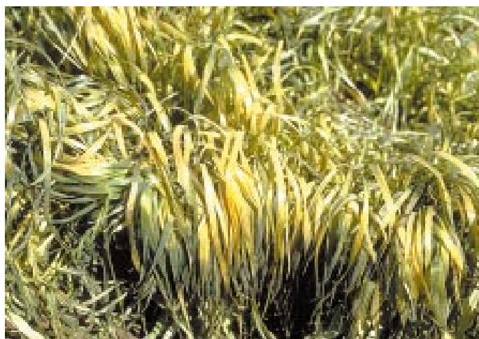
Figure 3: More severe freeze damage causes the entire leaf to turn yellowish-white and the plants to be flaccid. A silage odor may be detected after several days.