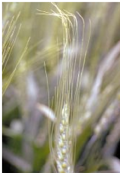
Figure 17: Symptoms of slight freeze damage may occur only on the awns as the spike is emerging from the boot or after heading. Awns become twisted and bleached or white instead of their normal green color. There may be no other damage to the rest of the plant.