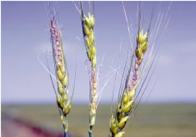
Figure 20: Damage may occur in different areas of the spike because flowering, which is the most sensitive stage to freeze, does not occur at the same time in all florets.