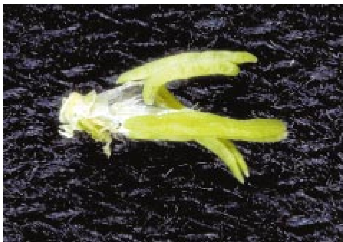
Figure 14: Close-up of twisted anthers and unopened whitish stigma shown in Figure 13.