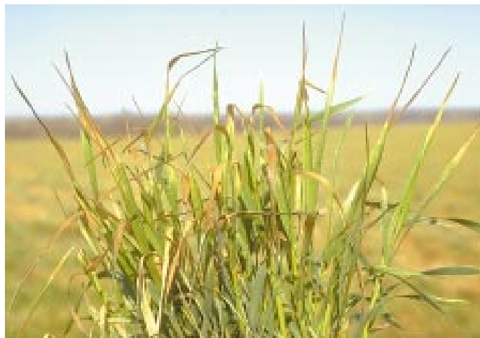
Figure 2: Leaf tip burn and yellowing are common spring freeze symptoms at the tillering stage.

The degree of injury to wheat from spring freezes is influenced by the duration of the low temperatures as well as the low temperature reached. Prolonged exposure to freezing causes much more injury than brief exposure to the same temperature. Temperatures at which injury can be expected, shown in Figure 1 and Table 1, are for two hours of exposure to each temperature. Less injury can be expected from shorter exposure times. Injury might occur at somewhat higher temperatures from longer exposure times.