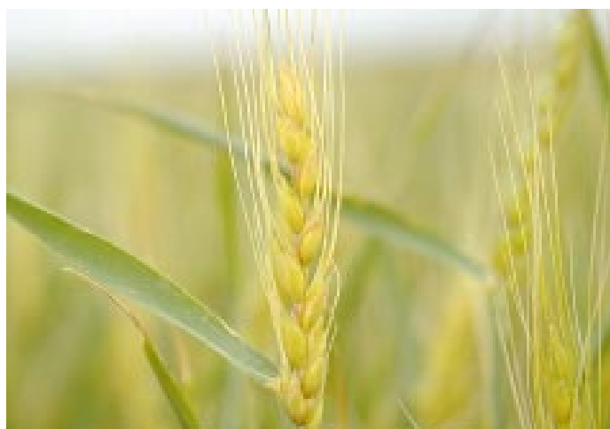
Figure 18: Freeze damage at heading causes glumes to become yellow and have a water-soaked appearance instead of green and turgid. The rachilla, the short stem that connects the floret to the spike, may become purplish-brown, indicating damage.