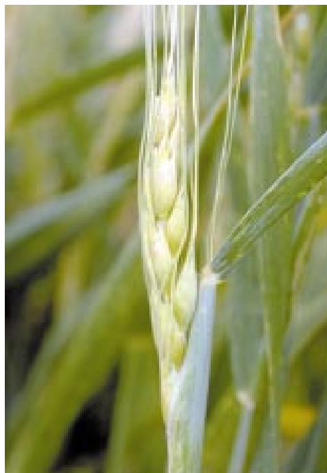
Figure 11: This spike is emerging normally, but the yellow, water soaked appearance, instead of the normal crisp, green spike indicates it is damaged.

Freeze injury at the flowering stage causes either complete or partial sterility and void or partially filled spikes because of the extreme sensitivity.