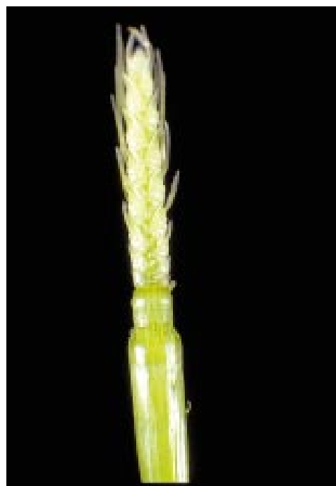
Figure 4: A healthy growing point has a crisp, whitish-green appearance.