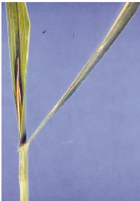
Figure 6: A yellow or necrotic leaf emerging from the whorl indicates the growing point is damaged.