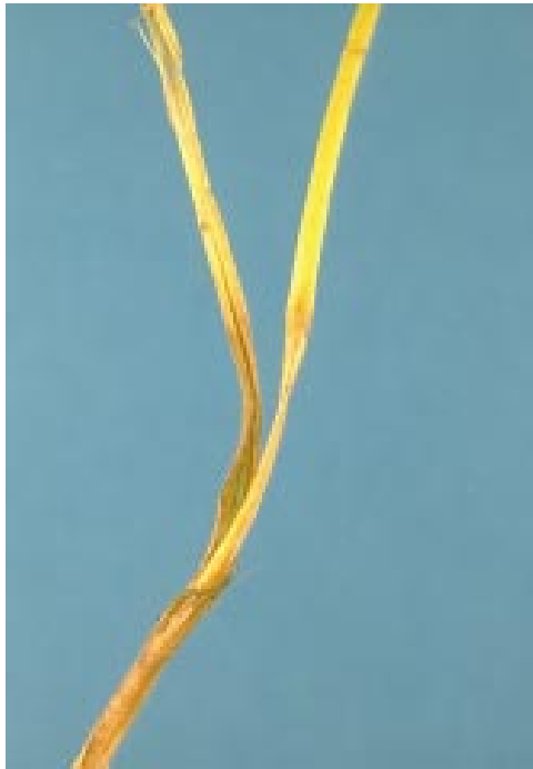
Figure 9: Collapse of internodes, which may lead to lodging, occurs with severe freeze damage.

areas causing further stem deterioration. Lodging, or falling over, of plants is the most serious problem following stem injury. Wind or hard rain will lodge the plants easily, slowing harvest and decreasing grain yields. With severe stem injury, splitting of stems and collapse of internodes is common (Figures 8 and 9). The growing point does not appear damaged immediately after a freeze. It will become dry and off-white to brown if the stem is damaged. Also, the growing point will not move upward. The loss of these early tillers releases the later tillers that would not normally develop because of too much competition.