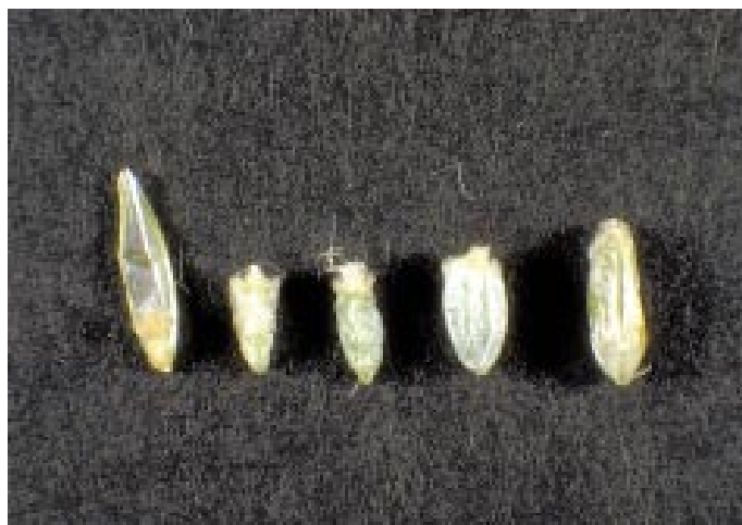
Figure 23: Kernel development stops immediately after freeze damage. Damaged kernels are grayish-white, rough and shriveled.