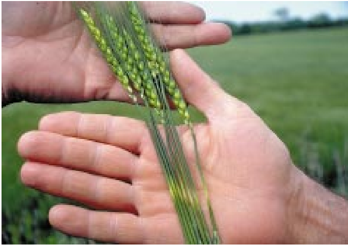
Figure 19: A whitish frost ring encircles the stem at the juncture of the stem and flag leaf at the time of the freeze.