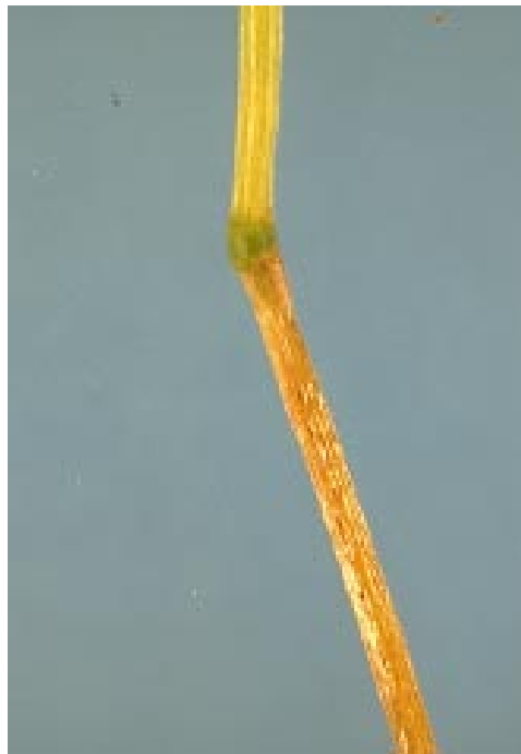
Figure 7: Discoloring and roughening of the lower stem are symptoms of spring freeze damage.

Mild stem injury does not appear to interfere with ability of wheat plants to take up nutrients from the soil and translocate them to the developing grain. Microorganisms might infect injured