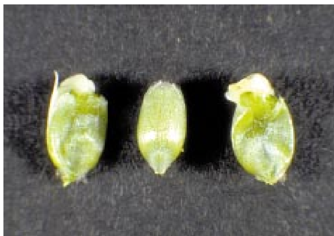
Figure 24: These healthy kernels at the milk to early dough stage contain a whitish fluid. Damaged kernels contain a gray to brownish liquid that is less viscous than the whitish fluid in undamaged kernels.