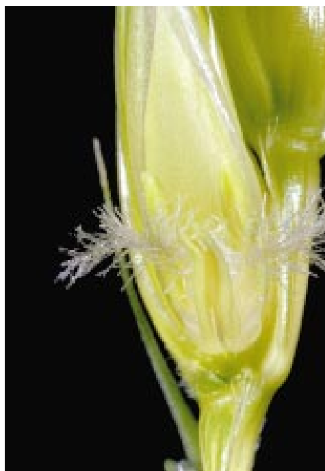
Figure 12: Healthy wheat anthers are trilobed, light green and turgid before pollen is shed. Each wheat floret contains three anthers. Healthy stigmas are white and have a feathery appearance.