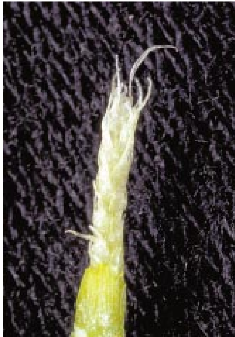
Figure 5: A growing point that has been damaged loses its turgidity and greenish color within several days after a freeze. A hand lens will help detect subtle freeze damage symptoms.

The many factors that influence spring freeze injury to wheat – plant growth stage, plant moisture content, duration of exposure, wind, and precipitation – make it difficult to predict the extent of injury. This is complicated still further by differences in elevation and topography in and between wheat fields. Official weather stations may not reflect true in-field temperatures. It is not unusual, for instance, for wheat growers to report markedly lower temperatures than are recorded at the nearest official weather station.