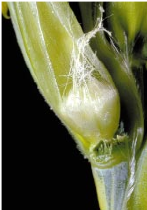
Figure 21: Shortly after pollination healthy kernels begin to develop and are greenish-white.

for several weeks after harvest. The grain should be given a cold treatment before testing, or germination tests should be delayed for about four weeks after harvest. If germination is slow and germination percentage is low four weeks or more after harvest, the wheat should not be used as seed. Shriveled seed should not be used in any case because field emergence is poor even if germination percentage is high. In addition, shriveled seeds produce less vigorous seedlings that usually yield less grain than seedlings from good quality wheat seed.