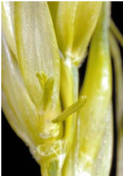
Figure 13: Anthers become twisted and shriveled, yet they are still their normal color within 24 to 48 hours after a freeze. A hand lens is necessary to detect these symptoms.