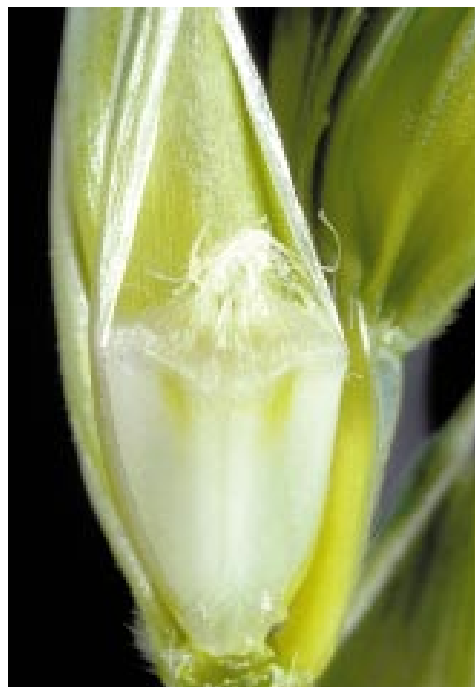
Figure 22: As healthy kernels continue to develop, they will contain a clear liquid.

Before destroying damaged wheat and planting another crop, growers should consider that production costs, except for harvesting and hauling, have been incurred. Planting a new crop will have its own production and fixed costs. Therefore, the return of the new crop over its production costs must be greater than the wheat's value over harvesting/hauling costs to make it worthwhile.