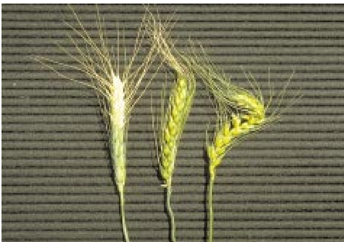
Figure 10: The twisted spike on the right was trapped in the boot and split out the side of the sheath. The awns of the middle spike were damaged while it was still in the boot stage. The spike on the left had partially emerged when freezing occurred so only the upper portion of the spike was damaged.

Many symptoms of freeze injury that occur at early stages might also be present at the boot stage (Figure 16). Leaves and lower stems might exhibit