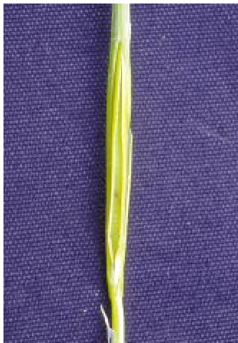
Figure 8: Splitting of stems occurs with severe freeze damage.