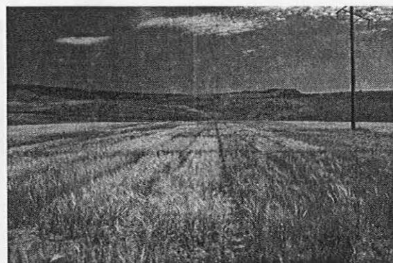
2001 Spring wheat and barley plots at Hayden, Colorado. July 30, 2001.

Comments: Grain yield in the spring wheat variety performance test averaged 16.8 bu/ac. There was no lodging. Varieties with a hardness below 40 were Dirkwin, Edwin, and ID 377s. Precipitation during the 2001 growing season for the months of April, May, June, July, August, September, and October was 0.98, 1.37, 0.69, 1.49, 1.51, 0.90, and 0.99 inches, respectively. Precipitation in the Craig/Hayden area varies considerably from month to month and year to year and is the most limiting factor for dryland grain yields.