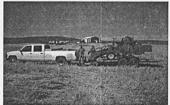
Harvesting wheat plots at Hayden, Colorado. August 29, 2001.