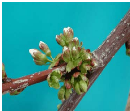
Fig. 6. Stage 6, 'First White'.