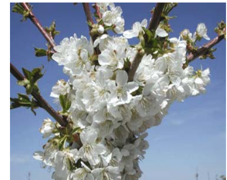
Fig. 8. Stage 8, 'Full Bloom'.

Critical temperatures (° F) for sweet cherry fruit buds. 1