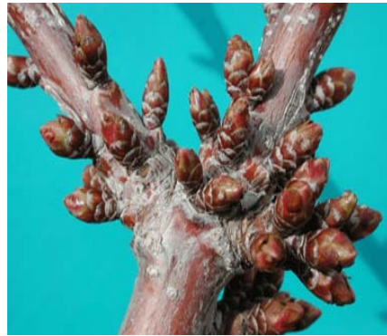
Fig. 2. Stage 2, 'Side Green'.