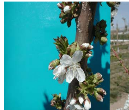
Fig. 7. Stage 7, 'First Bloom'.