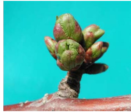
Fig. 3. Stage 3, 'Green Tip'.