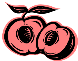
Palisade Peaches are in. Oh the sweet taste of summer.

Colorado AgrAbility can be found at http://agrability.agsci.colostate.edu