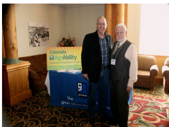
Teaching at the 2016 NGACO

multiple learning styles approach in partnership with CSU Extension, offering lecture, case study, and open question and answer sessions. While multiple meetings are Best Practices, they are not feasible due to the CAP format. To adjust for this variable, CAP invites local professionals to each workshop and offers contact details for local resources that can continue the work begun at the CAP/Extension Work Shops.