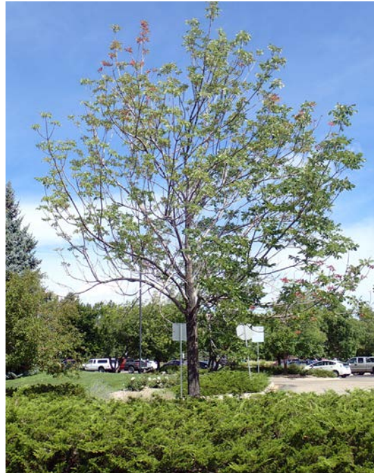
Figure 2. An ash tree showing advanced thinning of the canopy related to injuries produced by the tunneling of the flatheaded borer stage. This tree shows about a 60-70% reduction in crown canopy due to EAB injury. Trees showing this much injury are beyond recovery with insecticides.