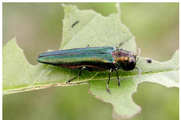
Figure 4. Adult emerald ash borers emerge beginning in late May and feed on leaves for several weeks before the female begins to lay eggs on the bark. Most insecticides used for EAB control can kill adults if applied in time for the insecticide to move into the leaves when adults feed.

Emerald ash borer is controlled by the use of certain systemic-types of insecticides that can be taken into the tree in some manner and will then move to areas where it can kill adults (leaves) or the flatheaded borer larvae (cambium). This is a different approach than is used for many other wood boring insects. Most wood borers, and bark beetles, are controlled using preventive insecticide sprays applied to the bark that kill the insects after egg hatch before they enter the tree ( Fact Sheet 5.530, Shade Tree Borers ). Emerald ash borer is not effectively controlled in this manner, but certain systemic insecticide can be very effective that kill either the adults as they feed on leaves and/or the developing larvae underneath the bark.