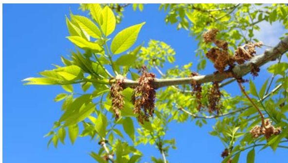
Figure 8. An optimum time for applying most emerald ash borer insecticides is shortly after leaves have emerged in spring. Systemic insecticides will not move in plants when leaves are not present. Also, ash flowers, shown in this picture, are dead at this time and no longer produce pollen that may attract some insects.

Imidacloprid will provide control for a single season. Treatments are best applied in spring shortly after bud break so that it will be present in leaves when newly emerged adults first begin to feed on leaves, before they begin laying eggs. Adults can normally be expected to begin to emerge from trees in mid-late May and adults will continue to emerge from trees into early summer.