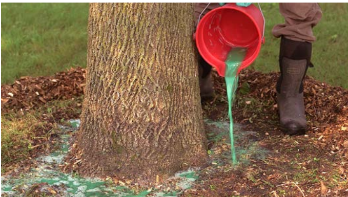
Figure 6. Imidacloprid can be easily applied as a drench around the base of the tree. If mulch is present it should be removed from the area treated then put back in place. The area must remain moist for at least a couple of weeks after an application to allow the insecticide to move to and be picked up by the tree roots.

Imidacloprid is normally applied as a treatment to the soil that is then picked up by the roots of the tree. This can be done as a drench, mixed with several gallons of water, poured onto the surface around the base of the trunk of the tree.