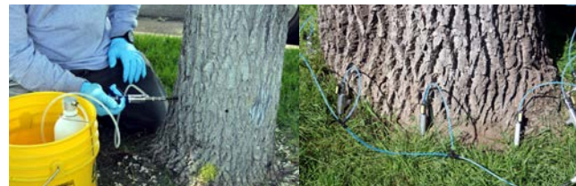
Figures 10a, b. The emerald ash borer insecticides emamectin benzoate and azadirachtin must be injected into the tree. This requires specialized application equipment, such as illustrated, and must be done professionally. These trunk-injected insecticides can provide control for at least two years.

Emamectin benzoate can only be applied through injection of the trunk using specialized equipment. Professional application is required both to apply it effectively and to avoid plant injury.