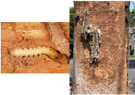
Figure 1. a) Emerald ash borer damages ash trees when the developing flatheaded borer stage tunnels through the area just under the bark. b) Emerald ash borer injuries prevent the plant from moving nutrients, causing progressive decline. Trees ultimately die from the cumulative effects of these injuries. Photograph of the larva courtesy of David Shetlar, The Ohio State University. Photograph of the ash trunk with EAB tunneling courtesy of Eric Day, Virginia Polytechnic and State University.

The tunneling by the insect reduces the ability of the tree to move water and nutrients, producing a progressive weakening of the plant. As the number of these wounds increase over time effects on tree growth become more apparent. Damage usually begins at the top of the tree, and this may result in a thinning of the leaf canopy, as smaller leaves are produced. Twigs and branches may die and in later stages of an infestation the insect may be found in high numbers in the main trunk.