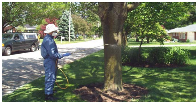
Figure 9. Dinotefuran is highly water soluble and moves rapidly in plants. It is the only emerald ash borer insecticide that can be applied as a spray on the bark, which can then move into the plant and move systemically.

Dinotefuran is most often used as a spray on the trunk. This insecticide is more mobile in plants than are the other EAB insecticides and is able to move through the bark and then move rapidly through the tree. Dinotefuran can also be applied to the soil in the same manner as imidacloprid, but is considerably more expensive and control is similar by this method.