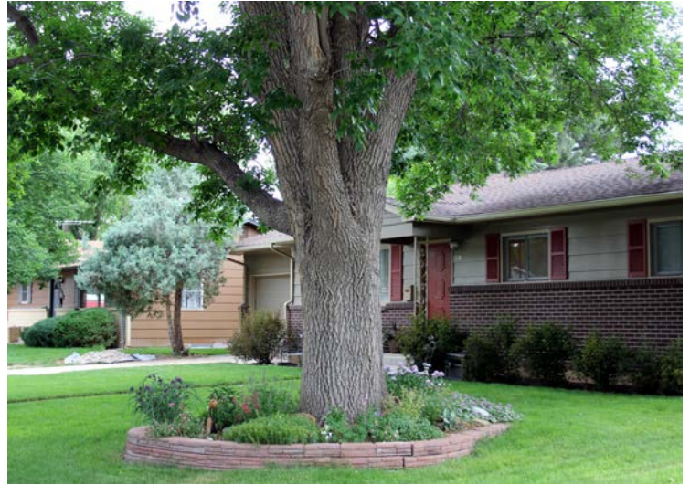
Figure 7. If there are flowering plants around the base of the tree, soil treatments of systemic insecticides cannot be used, as this would cause risk to pollinators visiting the flowers, which may contain insecticide residues in the nectar or pollen following applications.

If mulch is present around the tree this must be removed prior to application. This treatment cannot be made if flowering plants are present around the base of the tree , as the insecticide may move into the nectar of plants exposing it to pollinating insects.