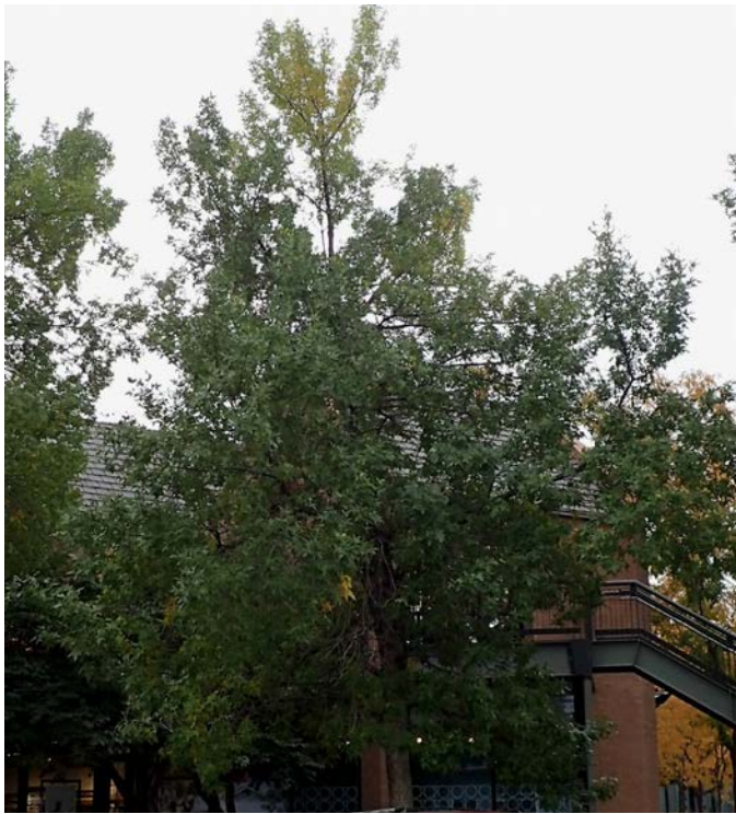
Figure 3. An ash tree showing a slight thinning of the top of the tree related to emerald ash borer injury. In this tree the canopy has thinned 10% or less from emerald ash borer damage. Trees that have thinned up to 30% can usually recover with a program that uses trunk injections of emamectin benzoate.

Once emerald ash borer has begun to infest a tree the injury it causes will increase over time so that the tree will ultimately be killed, unless treated with insecticides. The length of time it will take from the day a tree is first colonized by emerald ash borer until it will die will normally take several years, but the speed of tree decline will depend on many factors. These include the original health of the tree, weather, and the number of emerald ash borers developing in nearby trees.