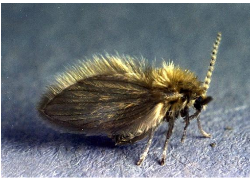
Figure 2. Moth fly, side view.

Distribution in Colorado: The genus Psychoda includes 21 species with man of widespread distribution and several that may be encountered indoors. Common species that have been widely spread by human activities include Psychoda alternata Say, P. pusilla Tonnoir, P. trinodulosa Tonnoir, P. umbracola Quate, and P. uniformata Haseman.