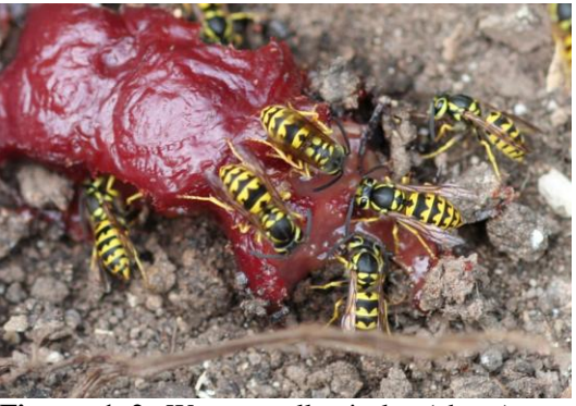
Figures 1, 2. Western yellowjacket (above). Western yellowjackets scavenging (below).

Distribution in Colorado: Various yellowjackets can be found in most of the state, although they are largely absent in rangeland on the eastern plains and at highest elevations. Yellowjackets are most abundant in wooded areas and some thrive around residential developments.