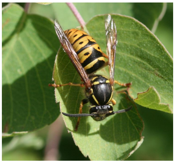
Figure 8. Aerial yellowjacket, Dolichovespula arenaria . This species makes large paper nests that often are attached to buildings.

Table 1. Yellowjackets ( Vespula species) reported to occur in Colorado (from Akre et al. 1980). Those in the Vulgaris group are primarily scavengers; the Rufa group are predators of insects.