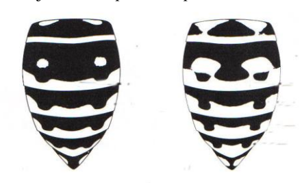
Figure 7. Gaster patterns of the forest yellowjacket, Vespula acadica .