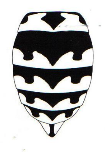
Figure 5. Patterning on the abdomen (gaster patterns) of the western yellowjacket, Vespula pensylvanica .

yellowjacket, including the two most common species in Colorado (western yellowjacket, prairie yellowjacket). Several commercial designs are available and most are baited with heptyl butyrate. Heptyl butyrate is highly attractive to the western yellowjacket but fresh fruit juices may also be used as baits.