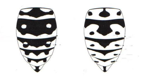
Figure 6. Gaster patterns of the prairie yellowjacket, Vespula atropilosa .