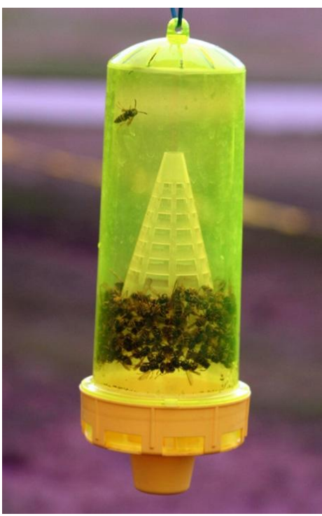
Figure 4. Traps baited with heptyl butyrate capture western yellowjackets and prairie yellowjackets.

The western yellowjacket young are fed animal matter but almost all is scavenged. Fresh carrion from recently killed animals, dead earthworms and dead insects are common foods. This scavenging habit extends to human foods and the western yellowjacket is a notorious scavenger of outdoor dining, readily feeding on meat, chicken, and fish. The western yellowjacket with occasionally capture live insects are also sometimes taken, such as aphids, small flies and leafhoppers. (Other yellowjackets, notably the prairie yellowjacket, are strictly predators and consume large numbers of live insects. The aerial nesting wasps in the genus Dolichovespula baldfaced hornet, aerial yellowjacket - are also