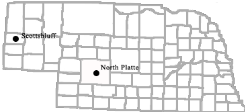
Two Nebraska Panhandle Dryland Locations