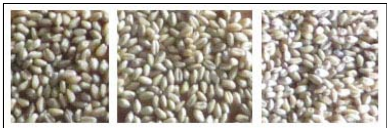
Fig. 19 Three Varieties of Wheat Seed That Can be Easily Distinguished by Farmers with Discerning Eye and Knowledge of Varieties Available in the Area.

There three primary concerns with market seed all of which can be easily overcome. The big concern is variety mixing. This may not be as big a problem in Ethiopia as seen in other countries. In the farmers meetings the farmers were well aware of varietal differences and recognized different varieties of wheat and barley, clearly knowing which barley varieties were preferred for brewing, and which wheat varieties were best suited for bread vs. pasta. Also, it appears that just closely examining the seed they could determine which varieties were present and degree of mixing as shown by one participant providing examples of three varieties of barley (Fig. 19). This may be mostly related to grain size but could require a discerning eye. As with the tractor access, the limited supply of certified seed could represent an informal income opportunity for those insisting on its use, as the village extension worker noted when they requested 300 kg of seed be provided to the local FCU, but only received 50 kgs., and defined the “progressive” farmers as those using the certified seed.