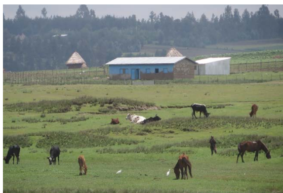
Fig. 7 Ministry Standard Meeting Building, but Located the In Middle of Open Field or Communal Grazing Area Instead of Cropped Area

The field visits to the designated locations for the farmers' meeting were already establish extension demonstration training facilities. These were located on land that was readily available to the government, but not necessarily convenient to the farmers or the farmers' fields (Fig. 7). They were often isolated from the community and surrounded by extensive communal grazing lands. Also, while there may have been some recent field demonstration activity for the most part the facilities appeared to have received only limited use. Thus there was little opportunity to compare any training ideas to what farmers were actually doing. The facilities consisted of fenced off compound with a main building but without electricity, so no lights or fans. The building contained a main class room with multi-person desks and chairs, a chalk board, and an instructor's table, but limited shuttered windows that when open only allowed for limited light. One meeting was actually outside. The building also had some storage and potential office space for the village extenstion officers.