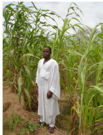
Fig. 20. Nigerian Farmer Obligated to Grow Low Yielding 3 M High Sorghum for Lack Of Improved Varieties in His Community

Here is an area where CRS working with SDCOR or other organizations, perhaps through the Church, could assist smallholder communities to facilitate the access to market seed of reasonable quality in terms of genetic purity and germination with minimal foreign material. This could follow the example of the Genetic Pump 14 , however the idea was developed for more adverse conditions in which all variety identity had become completely lost and farmers were using market seed that had not been updated for decades, resulting in growing three-meter-high sorghum when improved higher-yielding varieties were less than two meters (Fig. 20).