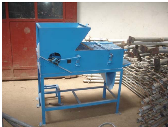
Fig. 35. Grain/Seed Cleaner Manufactured by Selem Children's Village.

off the drying floor from the most downwind pile (Fig. 34). Thus there may be the need to look at some simple mechanical winnowing machines that could bring the quality to international standards. Selem Children's Village also makes grain/seed cleaners that could be used after threshing (Fig. 35). Such winnowing machine might best fit into smallholder communities with the private traders who purchase most of the grain sold by the farmers. That is where the vested interest in a clean bag of grain is most appreciated. Thus when a farmer or perhaps a spouse brings some grain to market it can be quickly run through the cleaner. A clean bag of grain should command at least a 10% premium price over normal grain. This reflects the need for the buyer to remove the foreign material and represents both the amount of material removed shrinking the amount marketed and the costs for removing it.