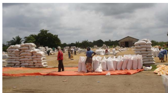
Fig. 44. Communal Drying and Winnowing Floor in Ghana With Tailing From on Pile Simply Contaminating The Next Downwind Pile, Making Clean Winnowing Difficult.

While the axle-flow can do a good job of threshing the grain leaving little grain left with the straw, it may not be capable of winnowing to the international standard of > 1\% foreign matter. Also, it is unlikely that the normal wind winnowing can achieve this level of clean grain, particularly if done on a communal drying floor where the tails from one winnowing pile simply contaminate the next downwind pile, only to have to be re-winnowed until eventually being blown