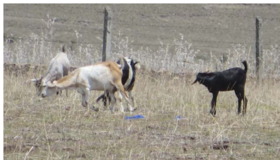
Fig. 24. Goats Effectively "Composting" Crop Residues in the Field.

Considering the time and energy required for using compost for nutrient recovery, it might be much easier and more effective to, where and when possible, rely on the herbivore farm animals, cattle, goats, sheep, even horse and donkey although the latter two are not really ruminants, to do the composting (Fig. 24, 25). At the very basic level it is virtually the same process. It is a microbial biochemical process of reducing the carbon and thus the volume while increasing the concentration of nutrients. For compost this is slowly done by the soil microbes, while in the animals it is more rapidly done by the ruminant bacteria aided by the extra body heat of the animals that expedite the biochemical process. Perhaps these herbivore animals should be considered portable composters, as they can be taken to the field to graze on crop residues thus effectively doing much of the collecting, process the material in place, and redistribute most of finished product i.e. manure back where it will do the most good. Effectively, the animals are taking materials that are normally burned because they cannot be manually or with animal power