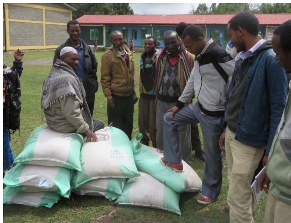
Fig. 2. Farmers Collecting Certified Seed from Farmers Cooperative Union

The visit to the “Farmers’ Cooperative Union” (FCU) was next door to the agriculture office, however when we got there it was lunch time and the offices and warehouses were closed. However, numerous farmers were seen picking up their supply of certified wheat seed (Fig. 2) and arranging transport back home. It appears that the FCUs has monopoly control on the distribution of certified seed and fertilizer for the farmers, at least to smallholder farmers, but the supply is limited so that most farmers, particularly the smallholders are left to plant “market” seed. Also, with limited supply the question of who get access come a concern, and if access may require a gratuity