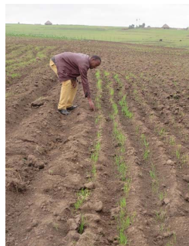
Fig. 21. Demonstration of Row Seeding of Wheat

There was considerable interest in promoting row seeding of wheat and barley as a means of increasing yields (Fig. 21). Again this was based on the physical prospects without concern for the additional operational requirements that might be needed. This was discussed at great detail with the farmers during the farmer meetings. They appeared to be well informed about row seeding, clearly stating the yields could be higher, but also the row seeding did require an extra animal-based cultivation to adequately prepare the land, and thus require approximately an extra week per hectare for land preparation. They also noted the extra labor required, claiming it would take about 15% more time than broadcasting, but would substantially reduce the time for weeding. The 15% extra labor is similar to the 20% extra labor for row transplanting rice, and results in most farmers opting to continue random transplanting to expedite the total transplanting