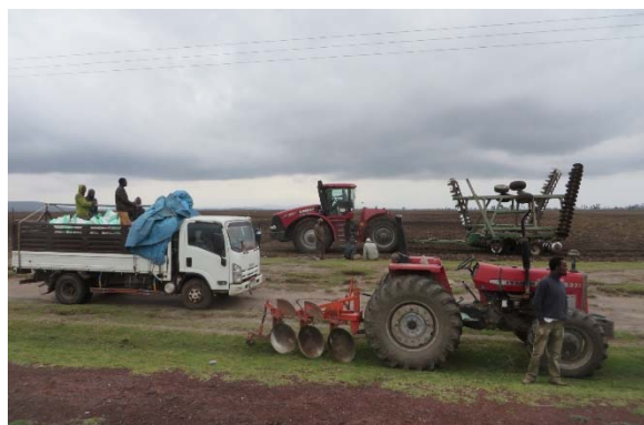
Fig. 3. Large Farm Receiving A Whole Truck Load of Certified Seed Directly From the Seed Company for Broadcasting on 74 ha Field

payment? This would result in priority going to large farmers as was noted in the field visit when we passed a large farm ready to plant his crop in a well prepared mechanically graded 74 ha field using cyclone broadcaster (Fig.3). It was also possible the dependence of the farmers on the FCU for seed and fertilizer was due to accepting institutional credit packages for these inputs that mandated they accept the whole package. This is often the case in other countries similar to Ethiopia.