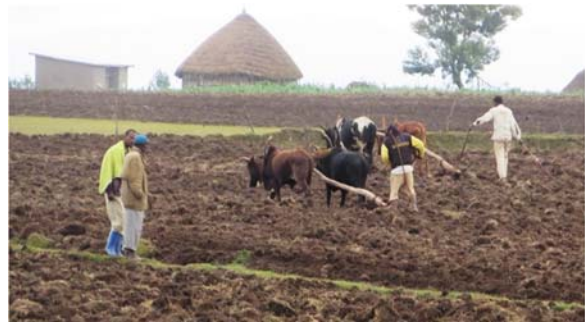
Fig. 12. Two Pairs of Draft Animals Doing Land Preparation.

However, in Ethiopia most of the land preparation is done by teams of two draft animals (Fig 12). This will probably substantially reduce the time for land preparation and crop establishment compared to manual operations, but will it be enough to comply with recommendations. The estimate time required for animal cultivation is listed as 0.25 ha/day. However, this probably refers to a well maintained team receiving supplemental feeds rather than animals surviving on communal grazing and crop residues. A more realistic time for more typically maintained animals grazed on unimproved pasture, possible emerging from the dry season in which they lost weight and conditioning, and without any supplemental grains, would be 1/6 th ha/day. In this case it will take a week for each cultivation. Thus, if it takes four cultivations for a minimum quality for broadcasting grains, with an additional cultivation for the quality needed to row seed, then it will take at least a month from when cultivation begins to start actually planting a crop. This will still leave a fairly ununiformed field compared to the large farm seen broadcasting wheat seed with a cyclone applicator that