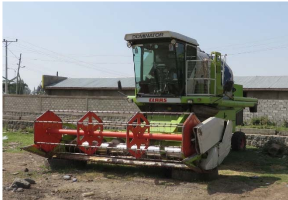
Fig. 28. CLAAS Combine Now Available in Ethiopia, Most Likely From European Based NGO

effort to convert them to pneumatic tires for dryer conditions. Perhaps they could become available through JICA, the Japanese aid program. The introduction of combines into the fully irrigated rice areas of Thailand increased the crop intensity from two crops per year to five crops in two years.