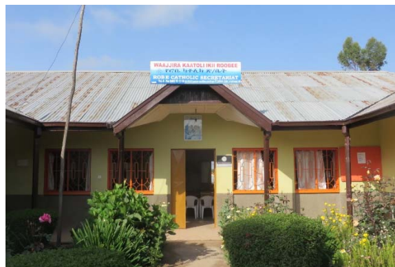
Fig. 3. SDCOR headquarters

The F2F assignment, ET-09, was implemented between June 19 and July 9. The objective was to provide “farmer training” on the best management practices for grains and legumes in Koffele, Ethiopia. Koffele is located some 215 km South of Addis Ababa at an elevation of some 2,656 meters. This makes for a cool temperate temperature regime ideal for growing temperate grains and vegetables. For this reason the staple crops appear to be potatoes, wheat and barley.