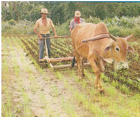
Fig. 23. The Latheo Used In the Philippines for Forcing Broadcasted Rice Into Rows for Easier Cultivation.

the more effective innovations for smallholder farmers although often over looked by the development effort.