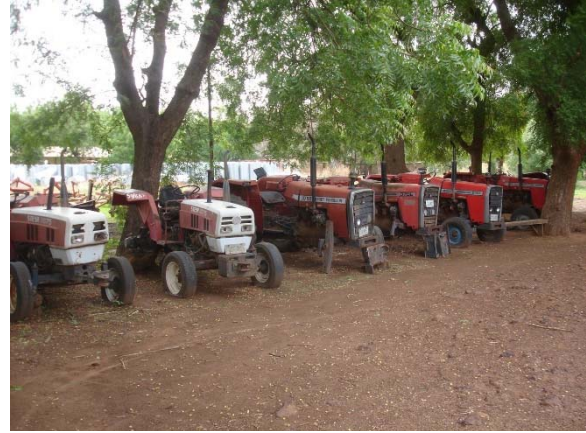
Fig.15. Typical Line of Surveyed Out of Operations Tractors With Less Than Half The Designed Operating Hours Outside any ADP In Nigeria.

minor repairs that, for reasons unknown, cannot be effectively organized. This can be clearly seen by the line-up of non-operating tractor outside any Agriculture Development Project (ADP) in Nigeria (Fig. 15). Also such communal tractors are often diverted away from the intended smallholders to serve larger more influential farmers, perhaps with the payment of an “access” gratuity. However, when individually owned tractors will usually get considerable more operation hours than the designed 10,000 hours. This is common throughout most of the Middle East from including Egypt, Iran, Iraq, Pakistan and Afghanistan, where most basic cultivation for smallholder farmers is by individually owned and operated private contract tractors. The exception being in terraced areas inaccessible to tractors and animals or manual is the only alternative. An example is the famous “World Heritage” 2000 year old Banaue Rice terraces in the Philippines. The terraces have been mostly abandoned because they could only be manually cultivated and can no longer compete with the more mechanized rice cultivation of Central Luzon (Fig. 16).