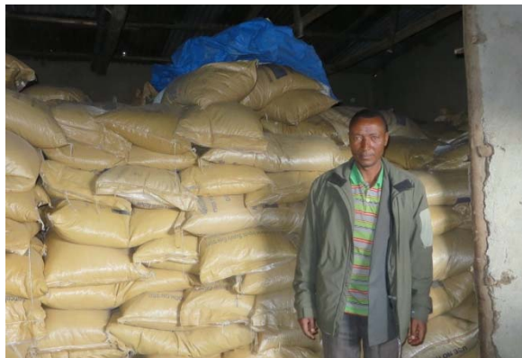
Fig. 6. Private Seed dealers with bags of "market" seed.

soil and not lost. However, there were no solid soil test to indicate the Phosphorus was that urgently needed. Most countries emphasis Urea as Nitrogen is usually the nutrient in greatest need.