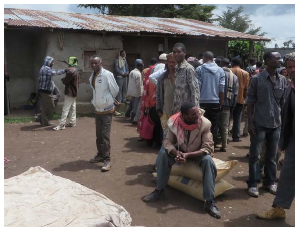
Fig. 5. Farmers' Cooperative Union Fertilizer Outlet Store for DAP at Open Market

As usual the open market was buzzing with activity. However, of concern were the two adjacent shops. One was the FCU's fertilizer outlet and the second was private seed seller selling “market” seed. As for the fertilizer the only thing available was DAP (Fig. 5). Urea would be available later in the season. However, in contrast to other countries Ethiopia appeared to be emphasizing DAP instead of Urea. This would typically provide an excess amount of Phosphorus to the soil, which would simply be banked in the