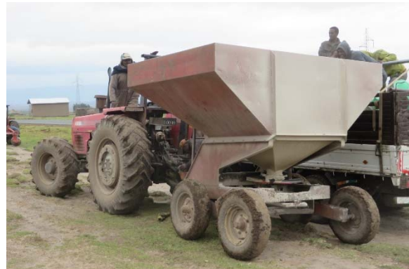
Fig. 22. Large Cyclone Broadcast Seeder Used On Large Farm with No Apparent Concern for Row Seeding.

In the Philippines on an exceptionally well drained and aggregated volcanic ash soil, readily accessible immediately after heavy rains, upland rice farmer have an animal drawn implement called a latheo that will take broadcasted seed and move them into rows where they can again be cultivated with the same implement (Fig. 23). This might be worth trying and the implement or at least a detailed diagram should be obtainable from IRRI headquarters in the Philippines. However, the soils in Ethiopia might not be friable enough for the latheo to be effective and not accessible for a couple days after a heavy rain.