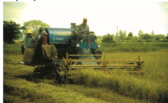
Fig. 29. Asian Combine that Might be Better Suited for Ethiopia than the German Combines

larger fields of Europe and may not be the best suited combines for smallholders' fields of half hectare or less particularly on sloping lands. Too much lost efficiency turning around and backing into corners. The running efficiency could be reduced by 20% or more. More suitable would be combines coming from Asia and designed to work in small rice paddies of one rai (1/6 th hectare) (Fig. 29). They are designed with only a two or three meter head. While these are all tracked combines for working the wet but drained paddy fields it should not take too much