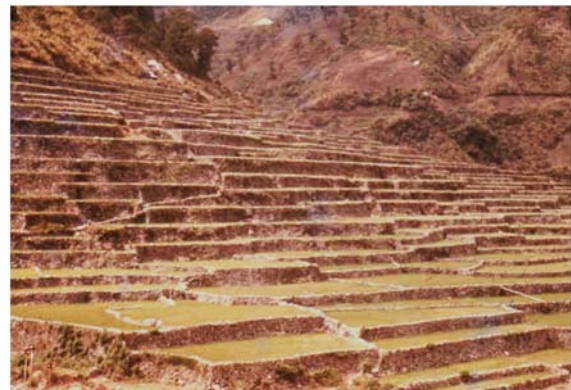
Fig. 16. Mostly Abandoned 2000 Year Old Rice Terraces in Banaue Phillipines Because they Could Only Be Manually Cultivated.