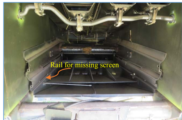
Fig. 30 View Inside the Straw Discharge Section of the CLAAS Combine Where Some Screens Carrying the Straw Past the Grain Augers May be Missing.