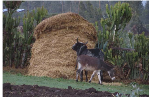
Fig. 25. Herbivore Farm Animals Happily Making Compost (Manure) from Straw Piles.

Furthermore, instead of having to exert energy in making the compost, the animals will actually derive energy from the process. This could have considerable value as in a recent agriculture forum based in Laos, discussing the new role of water buffalo now they are not used extensively of heavy draft with farmers shifting to the power tiller for rice preparation, it was eventually determined that the live weight of the animals was valued at US$2.00/kg. Thus feeding straw and other crop residues to the animals will have a financial value of US$2.00/kg of weight gain, or kg of weight retained, if during the dry season when animals often lose weight and draft conditioning. Thus feeding the animals will be a higher priority than making compost for most farmers particularly in Ethiopia which has the largest animal to people ration in all of Africa. This can easily be seen by the animals brought back to the homestead at night are left to munch on piles of straw, etc. (Fig. 25). It should also be noted that straw is not really a quality fodder and should be supplemented with grains or other feed concentrates, although this is most likely rarely done in smallholder communities and animal husbandry. Please also note that neither manure or compost represent a new fertilizer source to the community, but more a movement of nutrient around the community in what is ultimately a zero sum effort.