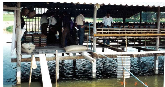
Fig. 18. An Intensive Poultry Farm Enterprise Suspended Over Fish Pond in Thailand Made Possible by Shift From Water Buffalo to Power Tiller for Rice Cultivation.

It should also be noted that an interview with a smallholder rice farmer in NE Thailand acknowledge that the shift from water buffalo to power tiller reduced his rainfed crop establishment period from four month to two months, expanded the area he was able to cultivate and allowed him to diversify into such intensive value chains as poultry suspended over fish (Fig. 18). The same should be expected of Ethiopian and other Sub-Sahara African farmers once they have access to the operational resources that will assure the food security for their staple food stocks.