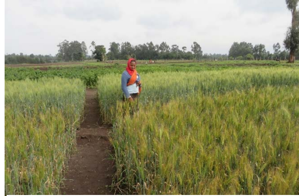
Fig. 8. Research Plots in Substation Area Across From SDCOR Headquarters

The overall impression of this part of the assignment was that it was rushed through without a lot of appreciation for its overall importance for adjusting any training programs. There was no effective opportunity to meet with farmers on an individual basis or visit farmers' field. Likewise no in-depth discussion with research or extension personnel that would highlight their concern with what the farmers were expected to do. The only reference to this was to row seeding instead of broadcasting wheat. For future F2F programs CRS might want to make certain the volunteers are more fully briefed on the state of agriculture in Ethiopia.