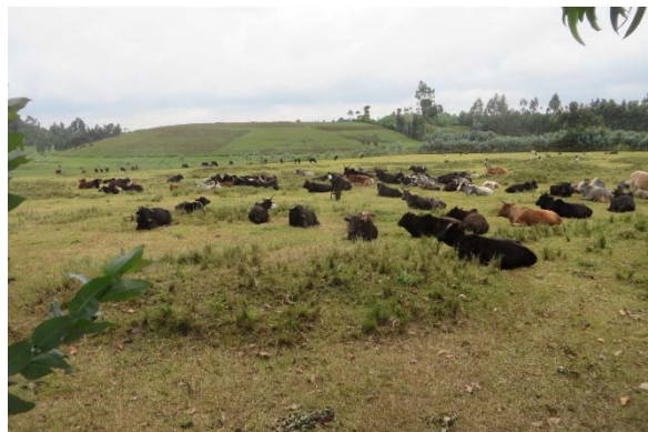
Fig. 9. Large Tracks of What Appears to be Prime Land being Devoted to Communal Grazing Lands with Crop Land on Far Slopes