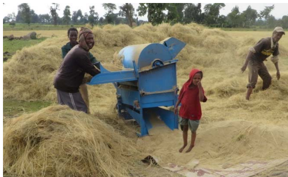
Fig. 33. Axle-Flow Thresher Being Used With Teff

distribute to private community based family enterprises living and working within the smallholder communities.