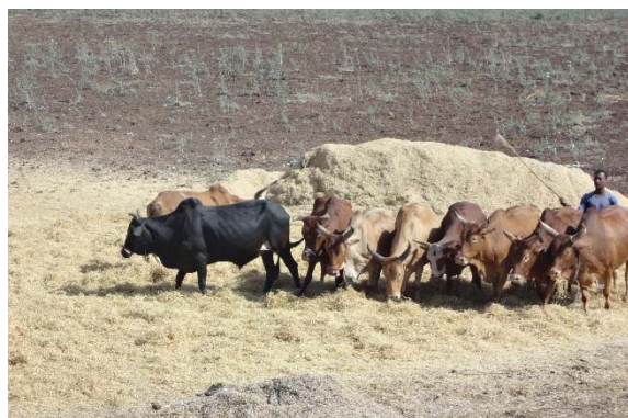
Fig. 27. Threshing Grains & Pulses By Animal Trampling, Leaving 30% of Crop Behind

Most of the harvesting remains done by hand, with the cut grain often stacked for up to two months before threshing. The threshing remains mostly done by animal trampling, which leaves up to 30% of the crop on the ground and contaminates the remainder with urine and feces that could reduce the market value (Fig. 27). This is a major area that innovations might be possible to improve the grain recovery and reduce the drudgery.