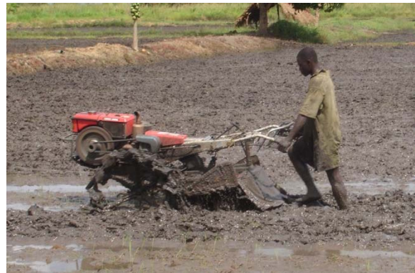
Fig. 27. Rice Power Tiller Being Used In Rice Scheme of Ghana.

Expanding the access to contract tillage with appropriately organized and managed tractors may need to be carefully considered. One of the farmers mentioned that if he had reliable access to tractors, he would get rid of some of his animals and expand the land he was cropping. If this was widely done, it could have a major impact on assuring food security for Ethiopia. It must also be appreciated the unrecognized role of mechanization in the success of the “green revolution” in Asia. How much of this is the result of new IRRI developed technology of short stature, high yielding, fertilizer responsive varieties and how much the concurrent self-financed shift from draft animals, mostly water buffalo, to rice power tillers. Since this was done by farmers without assistance from the development community, it goes mostly unrecognized by development community. However, how much land can be cultivated in the timely manner needed to take full advantage of the green revolution technology if left with the water buffalo compare to use of power tillers. Such power tillers are also slowing becoming available in rice schemes of Africa (Fig. 17).