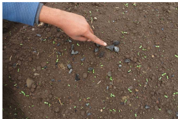
Fig. 26. Demonstration of Bio-Char Showing Lumps of Charcoal.

There is a current fad in the rural development effort to encourage applying bio-char to the soil with the expectation of improving soil moisture content and nutrient retention, this in addition to removing excess CO 2 from the atmosphere as a greenhouse gas, possibly expecting countries like Ethiopia to compensate the environment for the excessive use of fossil fuel by countries like the USA. However, this needs to proceed with extreme caution (Fig. 26). As with composting there it is unlikely to have enough charable material for an entire smallholder community or other recommendation domain, and most of the material may have a higher priority in the community such as firewood for cooking. This is really promoted from some rather questionable research studies in which only the highest application level showed a significantly measurable but not necessarily substantial difference. The result is an application recommendation of some 10 t/ha of char, which, because in making char 70% of the material is volatilized, requires 30 t/ha