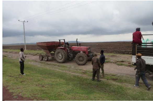
Fig. 13. Large 74 Ha Well Graded Field for Cyclone Broadcasting on Time Not Far From Koffele

appears to have at least been graded with a land-plane on a 74 ha field (Fig. 13). I think that is longer than accepted according to most “best management practice” expectation. If this is outside the recommended time frame, it has to be considered as operational and involuntary limitation, and not lack of knowledge. Also, this would support the contention that what is observed in the field represents the farmers optimizing the recommendations over their limited operational resource base. However, it is consistent with the volunteer’s personal observation from many smallholder communities in Ethiopia or elsewhere in Africa and beyond, that crop establishment tends to extend from the recommended time as the earliest up until as much as eight weeks past the recommended time. At no time were any smallholder fields actually sown during the assignment, even though the assignment was designed to cover most of the crop establishment activities. The only sowing and subsequent germination observed was from this large farm.