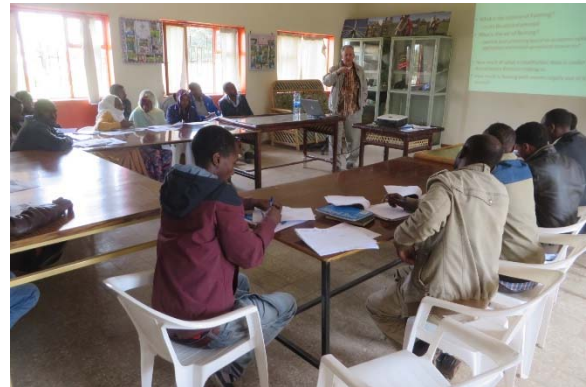
Fig. 10. Formal Training Program.

The “Training” component of the assignment consisted of two days of intensive PowerPoint presentations for government agricultural officers followed by four days of farmer meetings. The formal presentations were held in the SDCOR headquarters meeting room and were attended by 27 professional agriculture personnel from the agriculture department and the FCU (Fig. 10). These included three women from the FCU. The material presented was from two 60 slide PowerPoint presentation 6 . The content was a basic