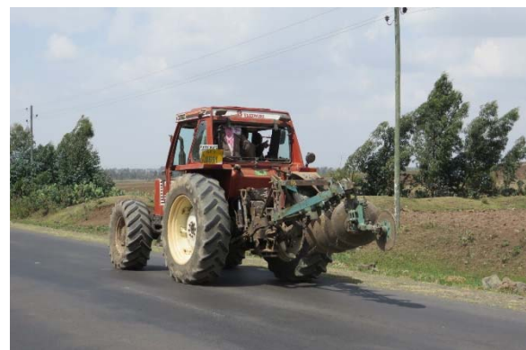
Fig. 14. A Contract Tractor on The Road to Robe Available for Contracting to Smallholder Farmers.

If smallholder farmers in Ethiopia, be that Koffele or other locations in Ethiopia or elsewhere in Africa, are more limited by lack of the operational resources to manage their land in as timely a manner as desired to comply with “best Management Practices” recommendations, then the most effective way of assisting them is to facilitate an enhancement of the operations resources needed to manage their lands. This very quickly become the need to look at access to contract mechanization. This is slowly taking place both in Ethiopia and the rest of Sub-Saharan Africa, but largely below the radar screen of the rural development effort (Fig. 14). This lack of interest in mechanization is part of the over sight in not considering operational limitations, and the assumption that the delay in crop establishment is largely a risk averse concern, resulting in the assumption there is a labor surplus in smallholder communities. Hopefully this report has indicated this is unlikely.