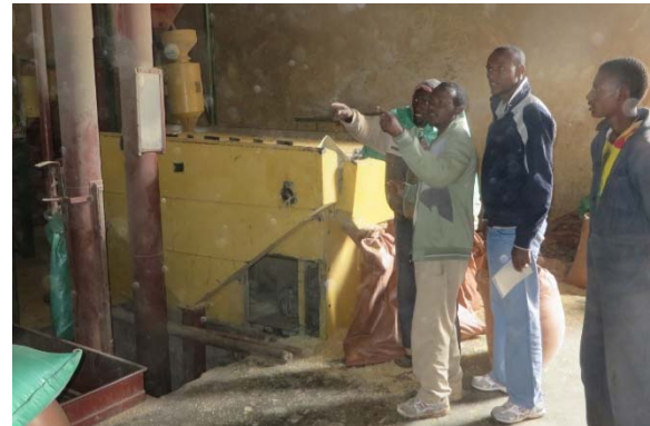
Fig.4. Seed Processing Equipment at Seed Company

The visit to the seed company, which was a government parastatal, appeared to be a fairly well equipped facility that could process and store quality seed (Fig. 4). The place was open for business and we were allowed to freely wonder around the facility. It had several warehouses that held incoming seed separate from processed seed, good cleaning, bagging and labeling equipment and good clean storage facilities. In stock were seed for wheat, barley, hybrid maize and teff. It was not possible to determine if the seed was produced on government farms or under contract to seed farmers. Nor was it possible to determine if the quantity of seed was able to meet all the demand, but it was understood the capacity was well below the demand so many farmers would have to rely on “market seed”. It did appear that some of the large farmers were able to purchase seed directly from the company, while smaller farmer had to get seed from the FCU. It would be interesting to see the price difference between direct purchases by large farmers and through the FCU assuming that most of the difference would represent the overhead costs of the FCU.