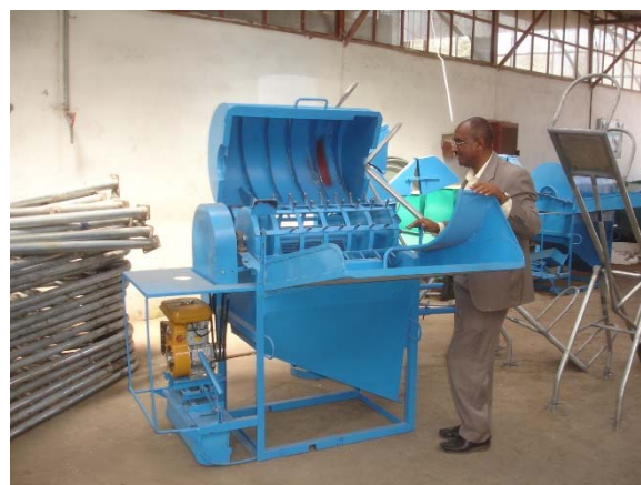
Fig. 32. Axle-Flow Thresher Being Manufactured at Selem Children's Village

Mechanical Threshing: The actual use of combines is very rare, as there just aren't enough available in country. An alternative that appears to be slowly becoming available in Ethiopia is the mechanical threshers modeled after the IRRI axle-flow thresher. These are currently being manufactured by Selem Children's village as part of their vocational training for adolescent residents (Fig. 32). Perhaps other organizations are or could manufacture similar thresher. Since the thresher was developed by IRRI with international funding, the blueprints are public domain and freely available directly from IRRI.