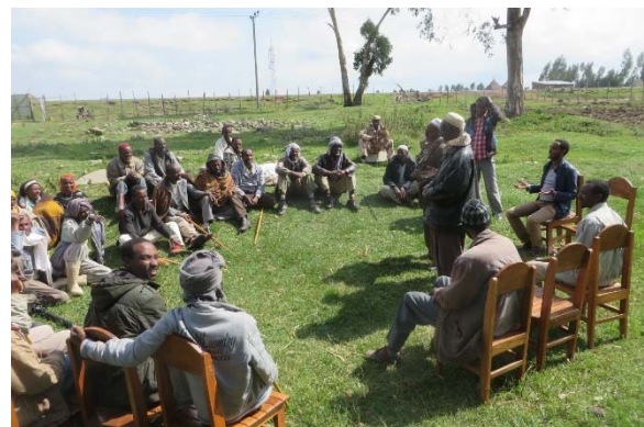
Fig. 11. Group Meeting with Farmers

The farmer meetings were set up for 20 invited farmers as arranged by the village extension workers (Fig. 11). This allowed for the invited participants to be biased toward the farmers better known to the extension officers and could be more representative of the “progressive” farmers than the general smallholder farmer population. In addition to the invited farmers other farmers just showed up and were encouraged to fully participate. In one case the meeting coincided with the end of women program meeting, and these women were also encouraged to join the